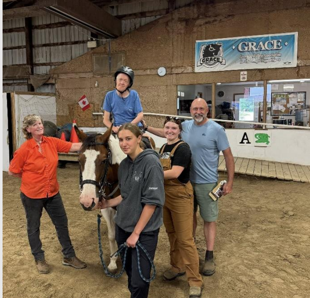
Visiting Georgian Riding Association for Challenged Equestrians (G.R.A.C.E.) (09 July 2025).