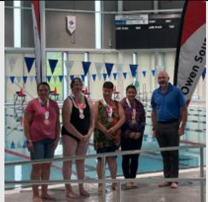
Honoured to present medals to Special Olympic Athletes during a regional swim competition, Owen Sound (14 June).