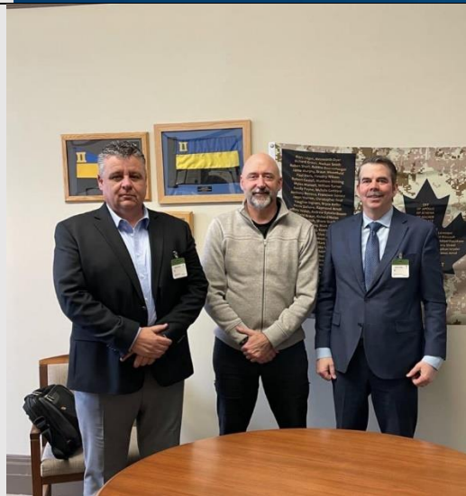
Meeting with P&H Milling Group (16 Feb 2023)