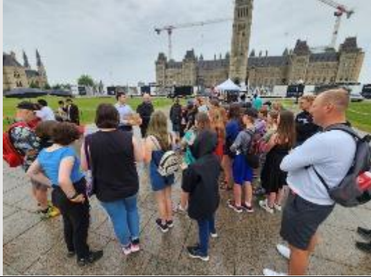
Speaking with grade 8 students from Arran Tara Elementary School as they visit parliament. (14 June 2023)