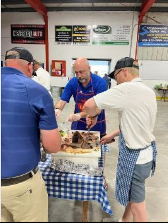
Attending and serving beef at the Grey County Beef BBQ & Dance. (3 June 2023)