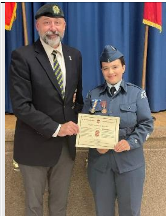
Impressive dress, drill & deportment at the 167 Air Marshal Bishop V/C Squadron 81st annual review! Congrats to the awards winners! (10 June 2023)