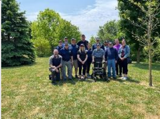
Recognizing the Tara Rotary Club on 85 years of community service. (10 June 2023)