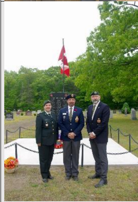
Moving RCL Branch 290 Tobermory service at Dunks Bay Cemetery to pay tribute to local veterans. It was honour to participate in the ceremony & march with the branch. (11 June 2023)