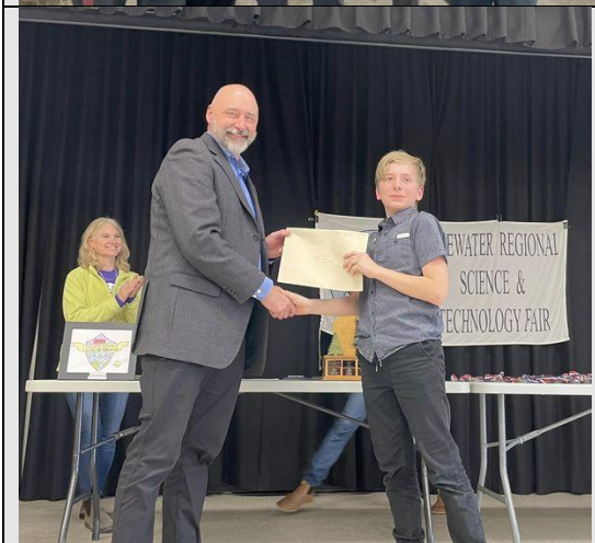
Attending the Bluewater regional Science and Technology Fair. (12 Apr 23)