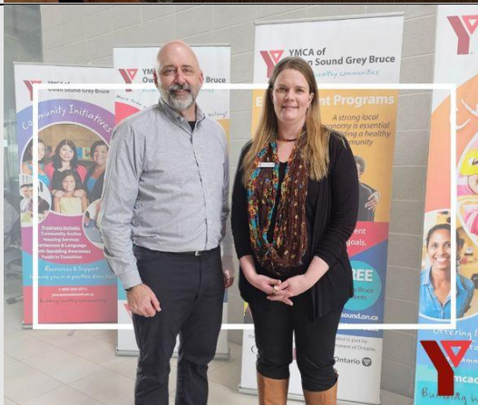
Touring the YMCA of Owen Sound (4 Apr 23)