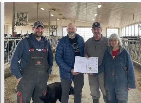
Great to recognize Christhill farms for their well deserved Master Breeder award. (10 Apr 23)