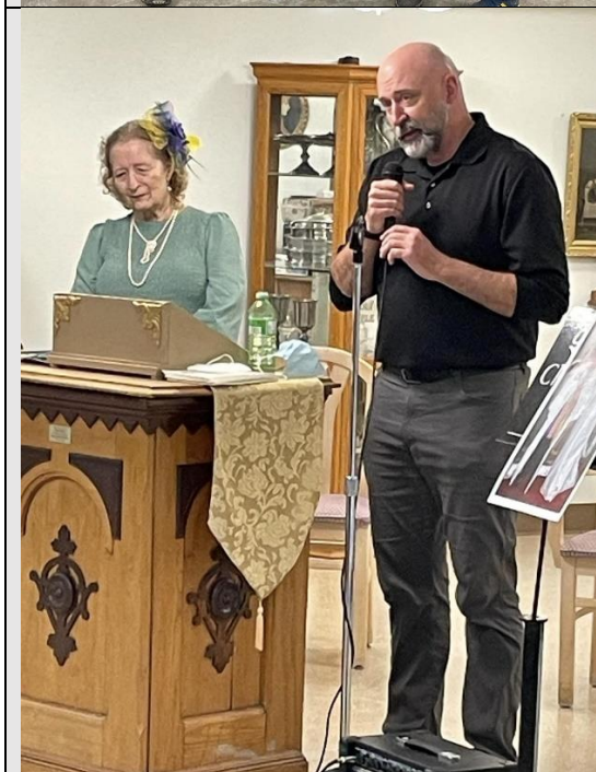
Attending the coronation tribute for HM King Charles III organized by the Grey Highlands Peace Committee at Grey Gables (06 May 2023)