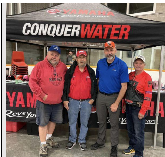
Attending the Keady Rod and Gun Show (06 May 2023)