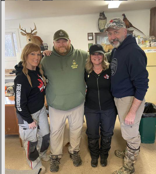
Attending Range Day at the East Grey Hunters & Anglers club. (22 Apr 23)