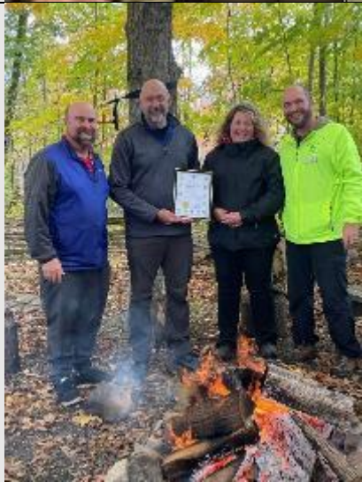
Congratulating the Bluewater Outdoor Education Centre for 50 years of education and conservation. (16 Oct 2022)