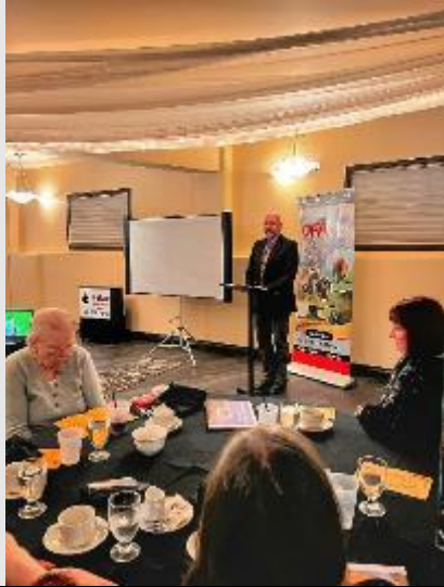
Speaking at the Grey County Federation of Agriculture AGM (13 Oct 2022)