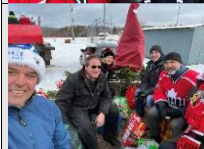
Chatsworth Santa Claus Parade (17 Dec 22)