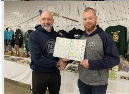
Celebrating the Tara Curling Club's 75 th anniversary (22 Jan 23)