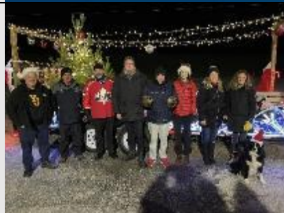
Warton Santa Claus parade (3 Dec 22)