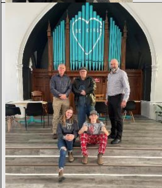
Touring the Hanley Institute in Flesherton (22 Dec 22)