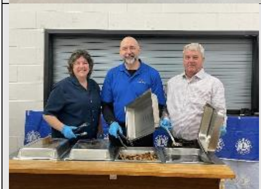
Helping out at the Sauble Beach & District Lions Club pancake breakfast. (21 Jan 23)