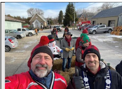
Feversham Santa Claus Parade (4 Dec 22)