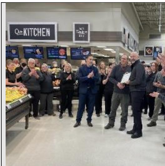
Attending the grand opening of the new Peacocks Foodland store in Tobermory (19 Jan 23)